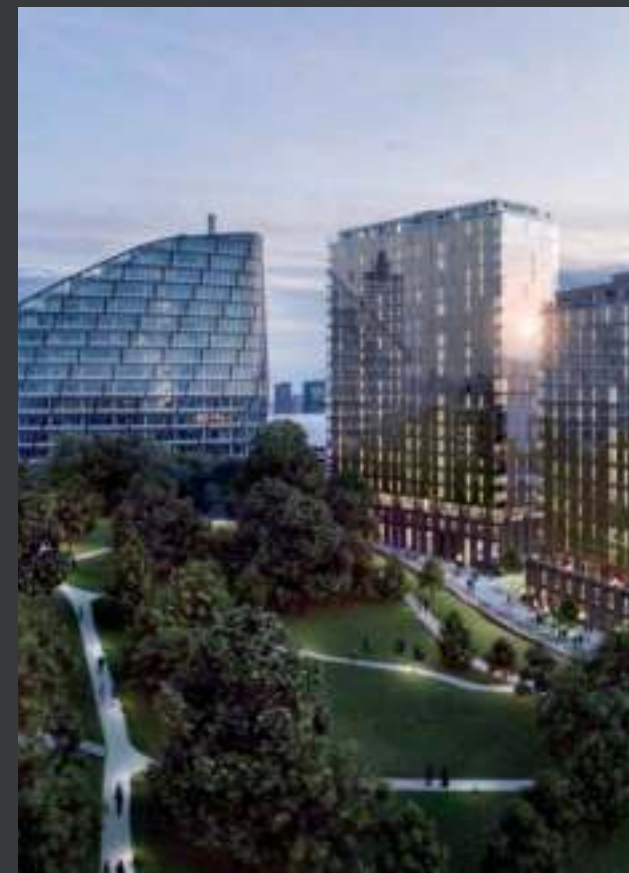
Above Meadowside, Manchester