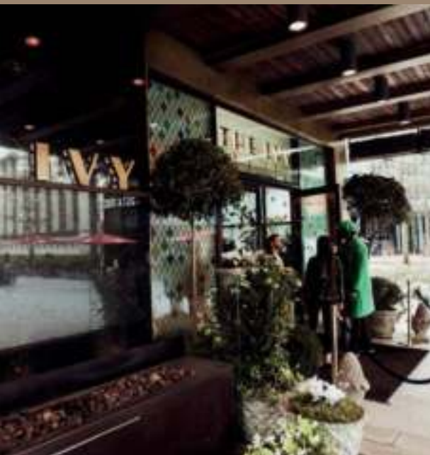
Left The Ivy Spinningfields

Manchester's food scene is as varied and vibrant as its art and culture.