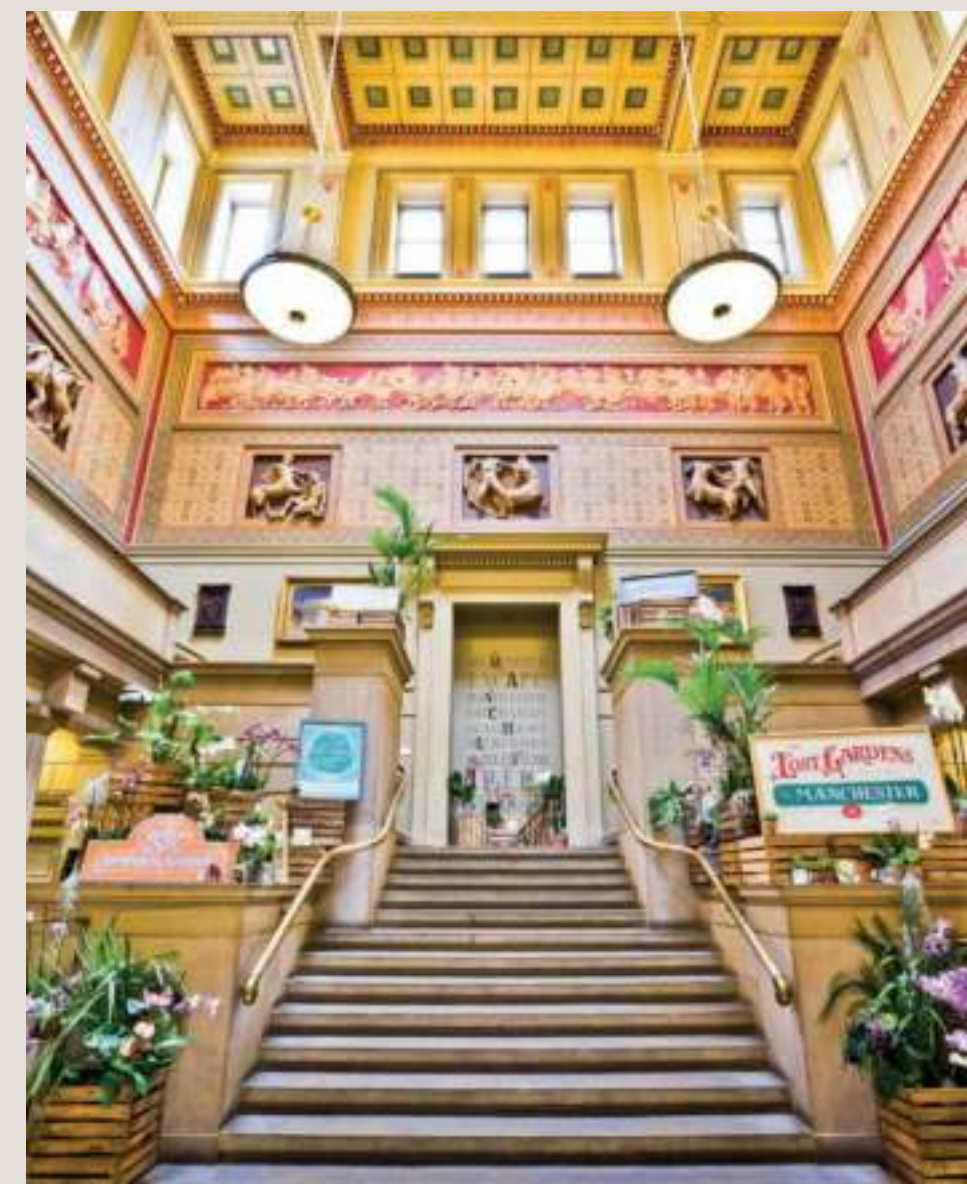
Right Manchester Art Gallery