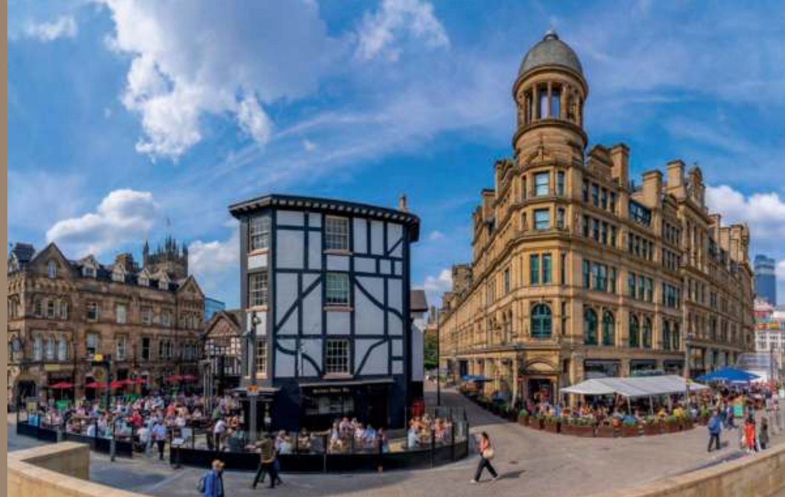
Right Mackie Mayor, Northern Quarter